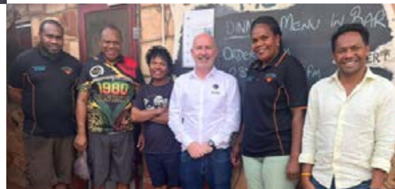
Hospitality workers from Curtin Springs NT