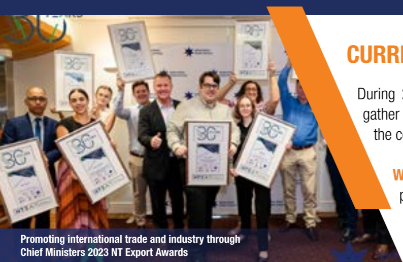
Promoting international trade and industry through Chief Ministers 2023 NT Export Awards

Connectivity: Improving cabotage, flight access, shipping logistics, and DAF (Quarantine) services.