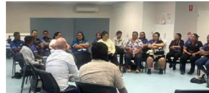
PALM Aged & Disability and Hospitality workers at Australian Remote and Regional Services (ARRCS), Alice Springs

The PALM scheme remains vital for addressing NT's workforce demands, with ongoing advocacy, partnership development, and worker protection. We thank all involved for their commitment to supporting NT's growth and workforce resilience.