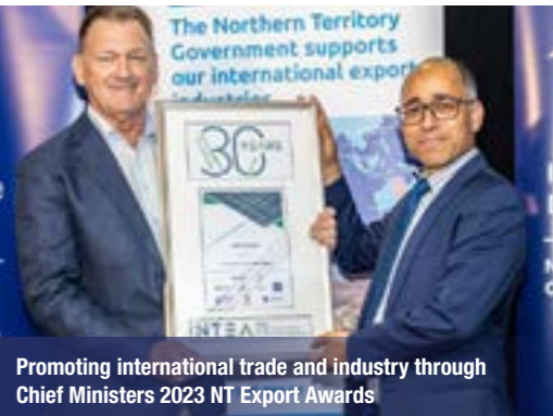
Promoting international trade and industry through Chief Ministers 2023 NT Export Awards