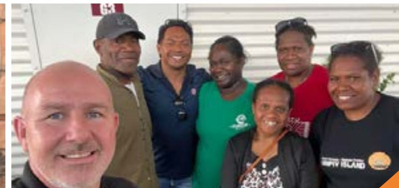
PALM Hospitality workers at Kings Canyon from Vanuatu