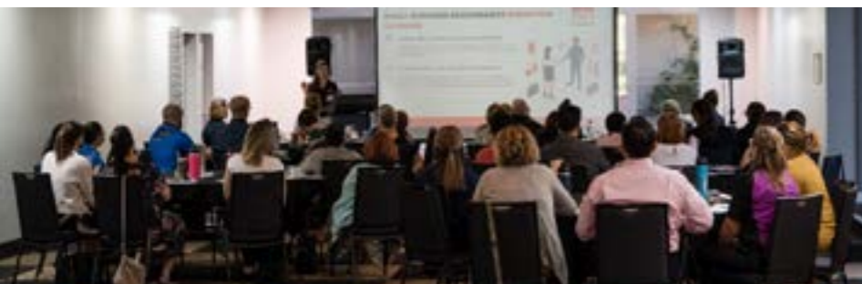
Industrial Workplace Relations Presentation to School Councils - Annual Business Managers Conference

Closer engagement with schools has resulted in increased utilisation of the technical support provided by the Workplace Relations team.