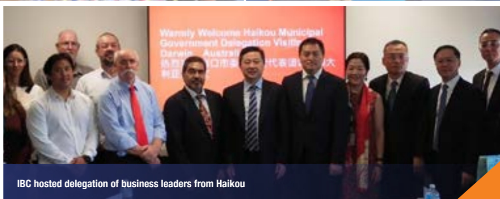
IBC hosted delegation of business leaders from Haikou