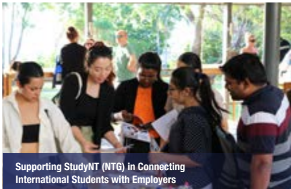
Supporting StudyNT (NTG) in Connecting International Students with Employers