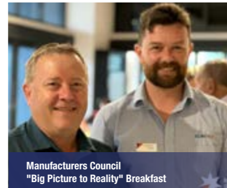
Manufacturers Council "Big Picture to Reality" Breakfast

The International Business Council is authorised by the Australian Government to issue documentary evidence of origin (Certificates of Origin) for goods exported from Australia in accordance with the relevant international conventions. The IBC also issue documents such as Certificates of Free Sale, Certificates of Good Manufacturing Practice, as well as providing certification services for other documents.